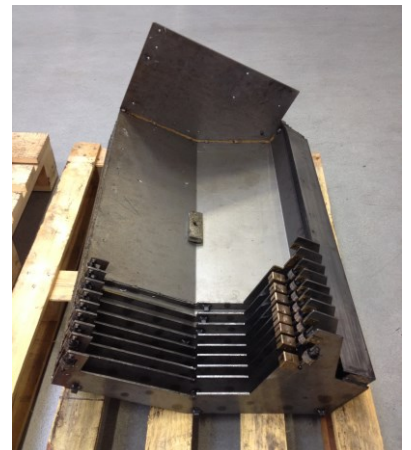
old axe spindle cover