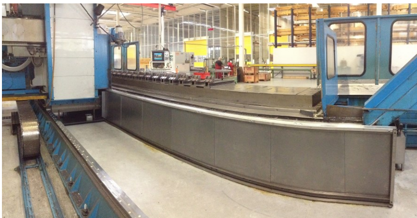
new axe spindle cover